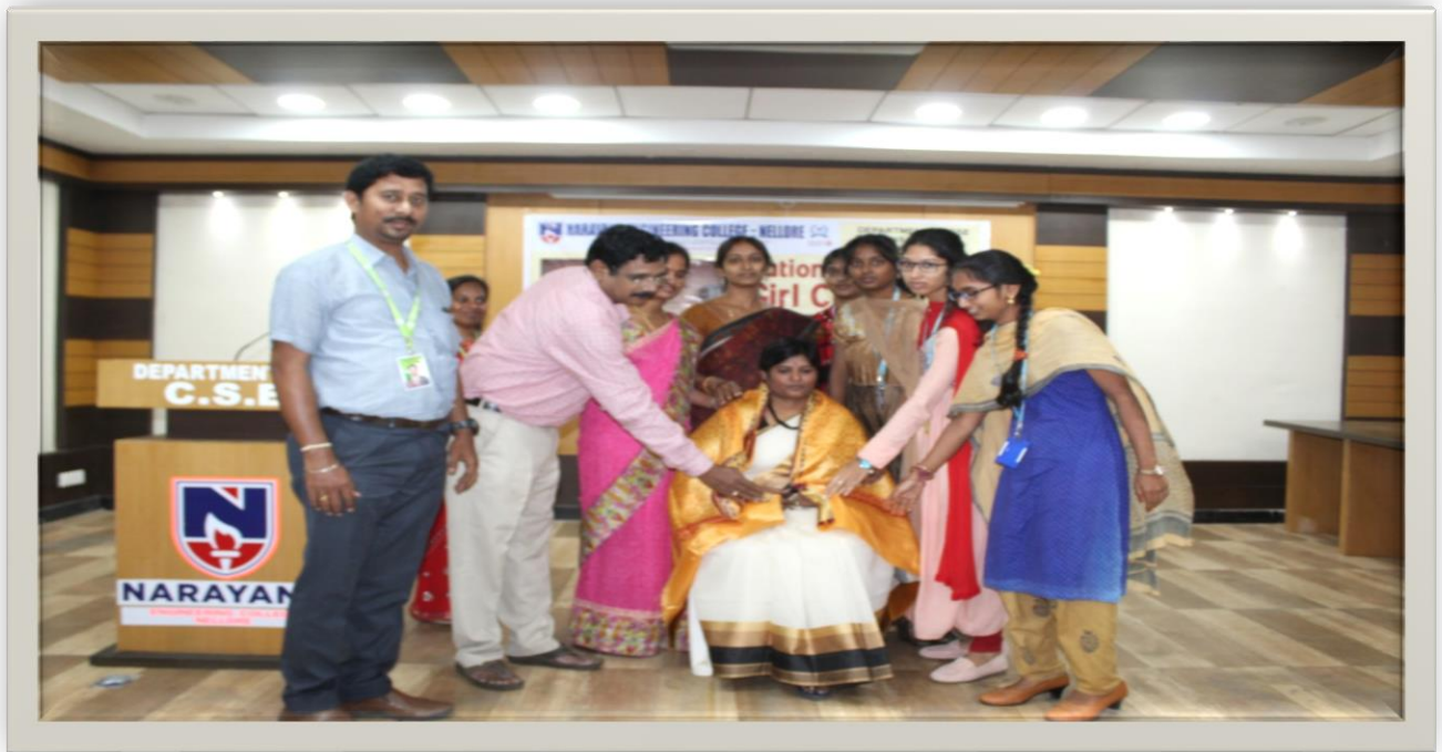
felicitation to the resource person by CSE HOD & staff