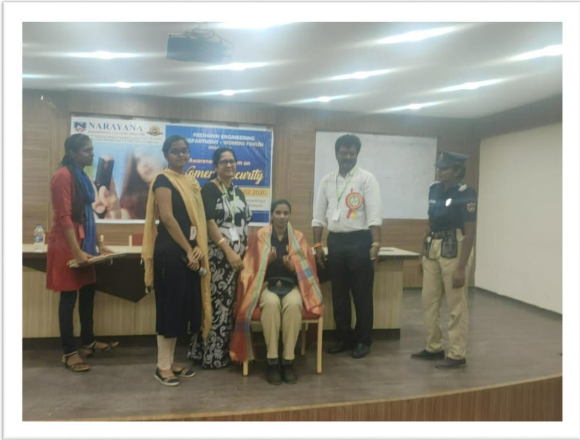
Felicitation to the Resource Persons by HOD & Women's Forum Convener