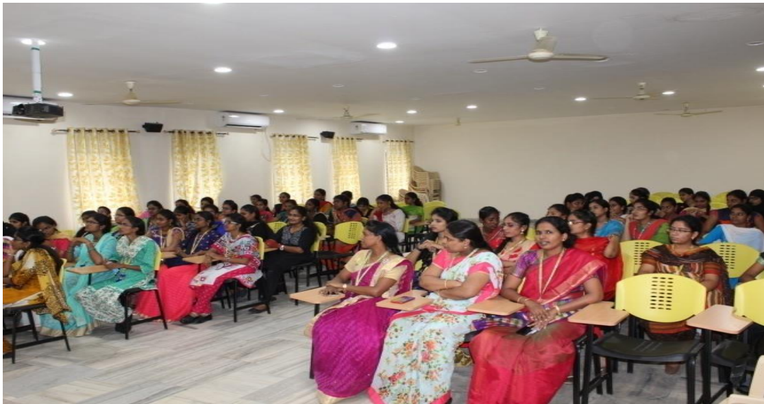
Students listening to Lecture