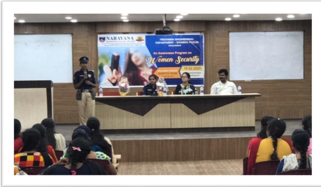
Resource Person delivering content about Women security