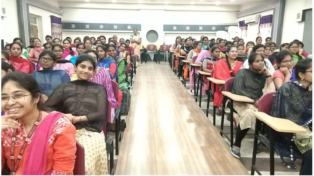
Students listening to the speech