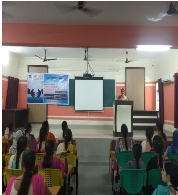
Students attended in the session