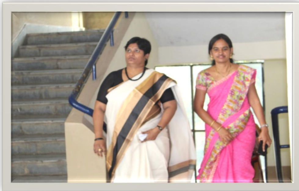
Welcoming resource person by CSE staff