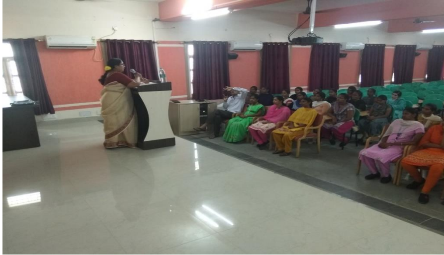
Students listening to the words of Resource Person