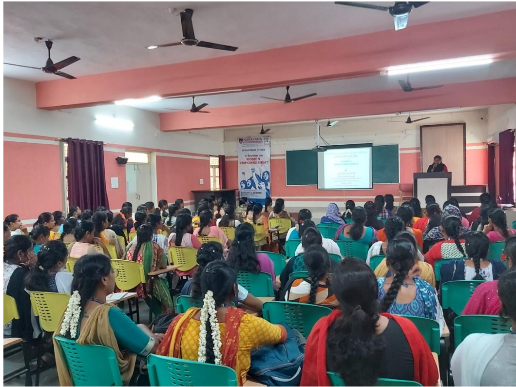
Students attention towards the lecture on women Empowerment