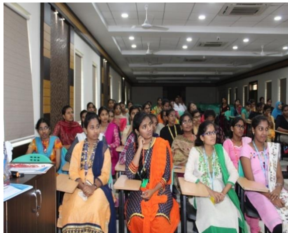
Audience listening to the speech