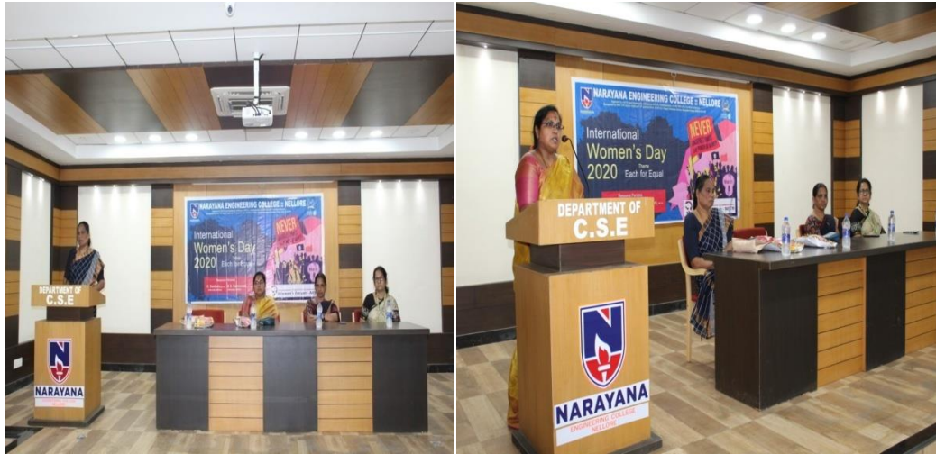
Chief guests Addressing the Gathering