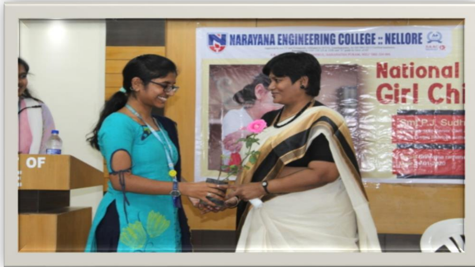
Welcome speech by the student